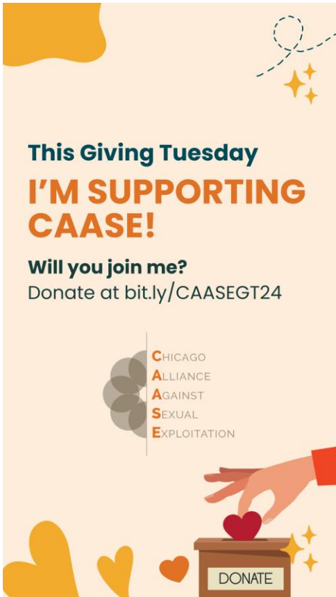
Download "I'm supporting CAASE" Instagram Story image here.