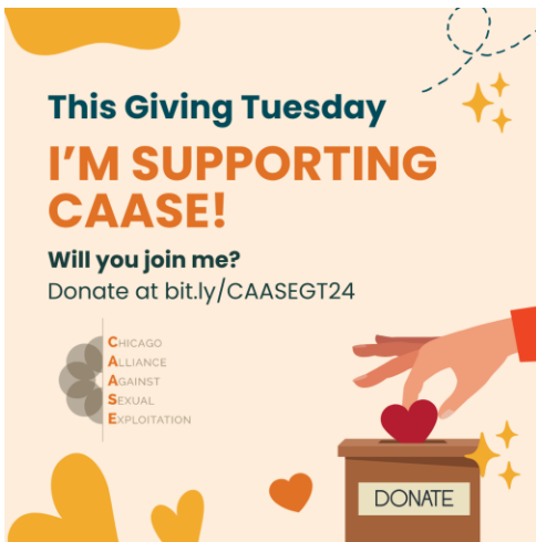
Download "I'm supporting CAASE" square image here.

You can also re-share existing posts and photos from CAASE’s social media. Feel free to add your own commentary and talk about why this work is worthwhile and why you believe your own friends and family should give and get involved too!